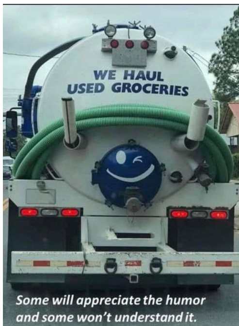
Some will appreciate the humor and some won't understand it.