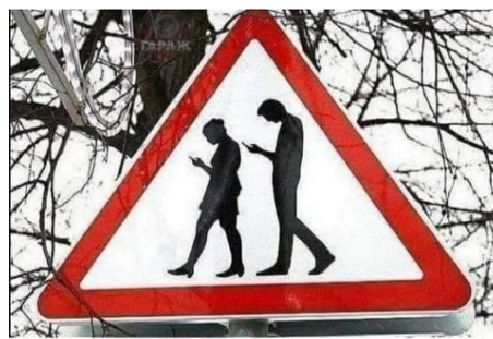
New Traffic Sign