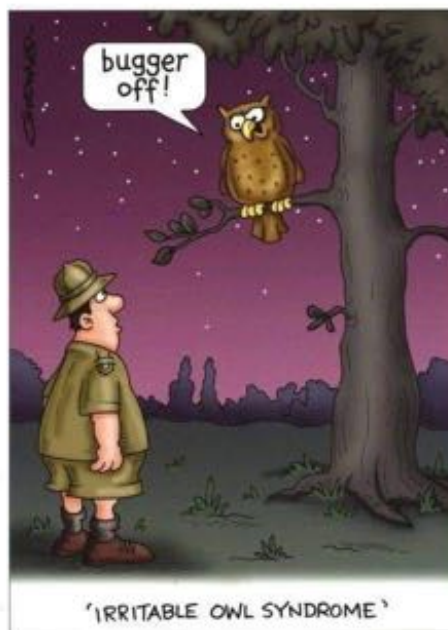
"IRRITABLE OWL SYNDROME"